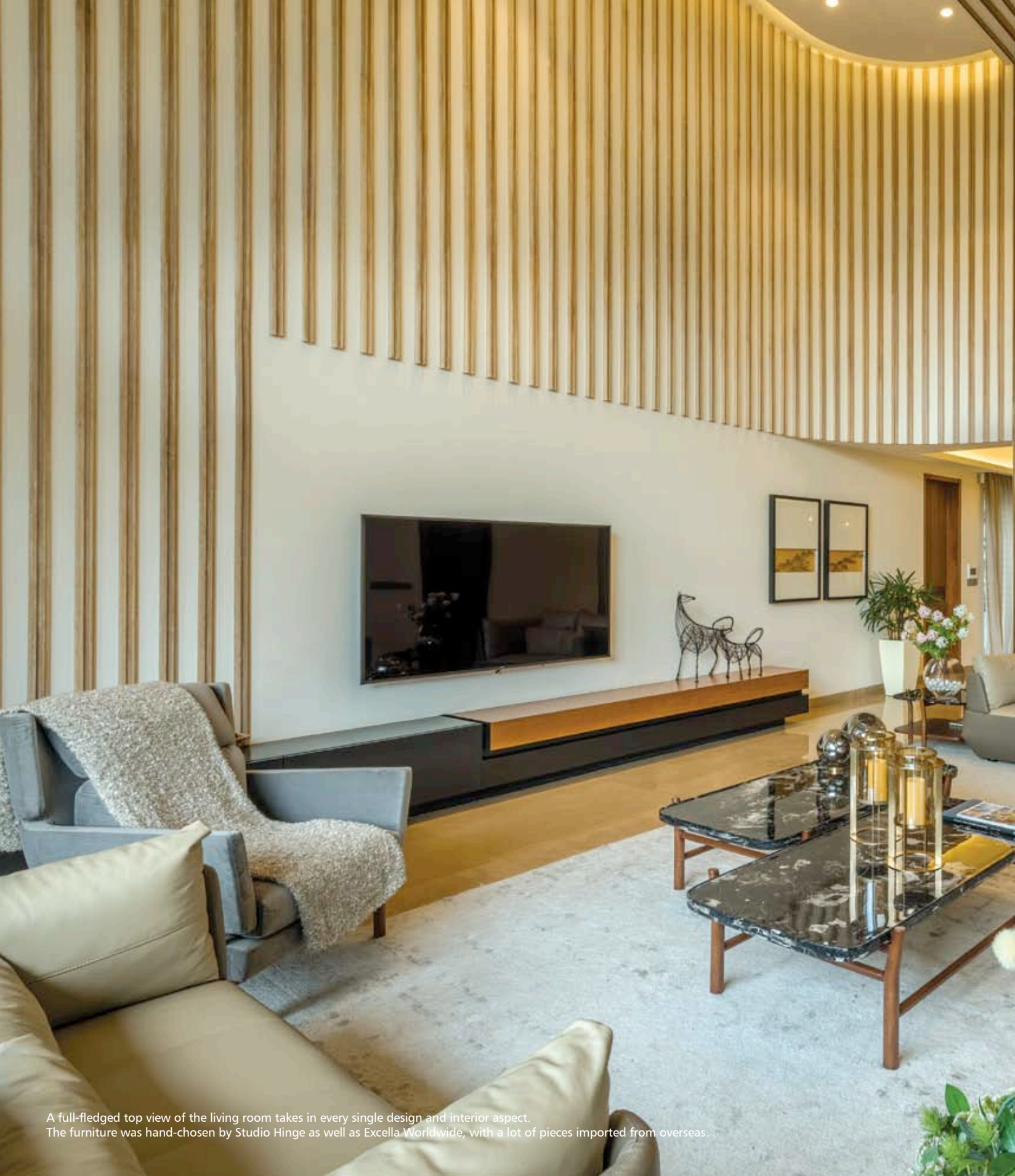
A full-fledged top view of the living room takes in every single design and interior aspect. The furniture was hand-chosen by Studio Hinge as well as Excella Worldwide, with a lot of pieces imported from overseas.