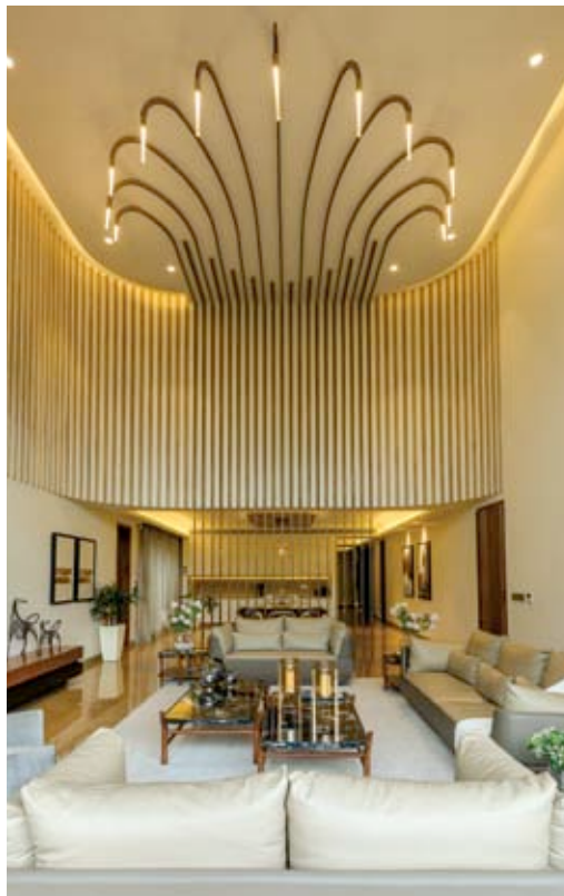
A full-fledged top view of the living room takes in every single design and interior aspect.