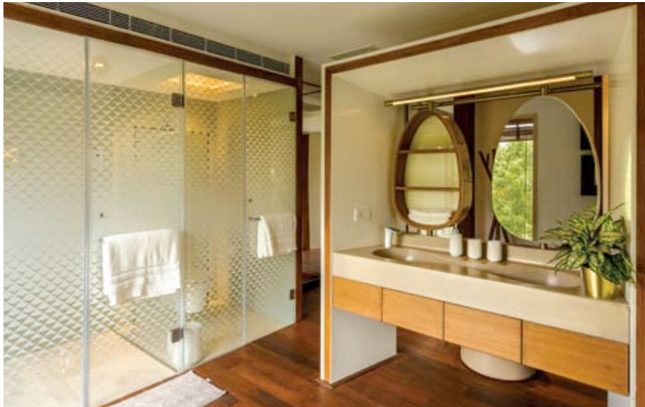
The bathroom is a true testament to the effusive style yet understated sophistication that Studio Hinge planned for the show flat.

The concept of luxury through utility found fruition in the design ideation and innovation brought into the space by Studio Hinge. A stellar example of this principle, and our personal favourite, is the conversion of the dry balcony area into a full-fledged kitchen, ideal for barbeque nights or wood-fired pizzas, etc. "Bespoke design and attention to detail is luxury," Pravin opines.