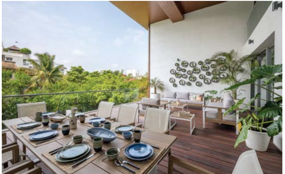
The fourth bedroom has direct access to the terrace. Ideal for evening parties, and intimate family dinners, the terrace is a cosy mix of warmth and luxury.