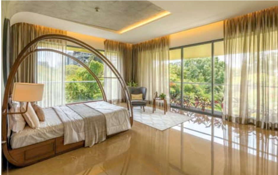
The bedroom is imbued with quiet simplicity and a colour palette that doesn't interfere with the natural light filtering through the curtains.